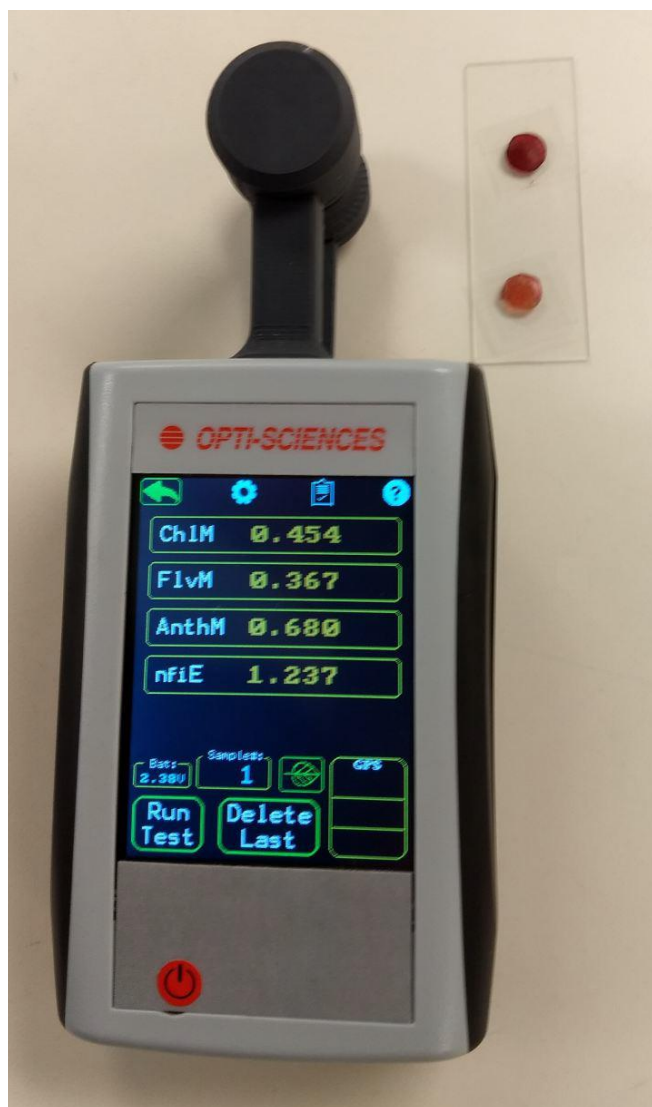
(a) Cerovic Z.G. et al (2008)

To assess grape ripeness, “berry cap” samples can be taken. The picture below shows samples taken with different levels of anthocyanins & flavonols on certain types of grapes. The caps were placed on microscope slides with cover slips and measured with MPM-100. Samples were cut using a 7mm cork borer and a razor blade (a)